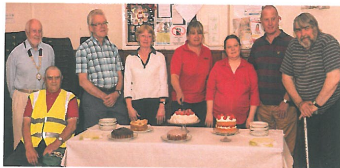
Some of the volunteer litter-pickers at the "thank you" tea