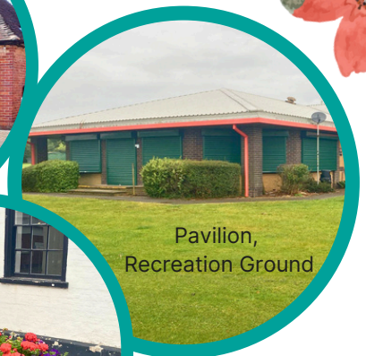
Pavilion, Recreation Ground