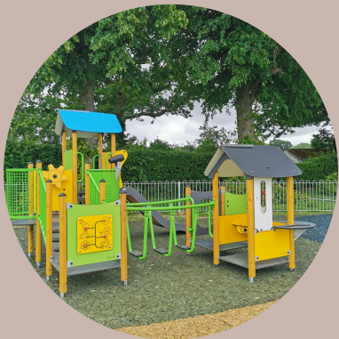
Parks, Playgrounds & Open Spaces