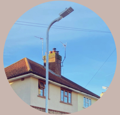
Streetlights & Bus Shelters