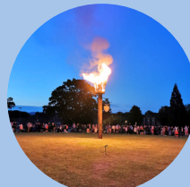
Tourism & Events