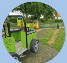
Parks, Playgrounds & Open Spaces