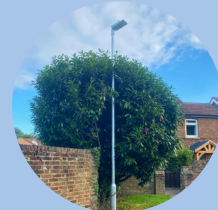
Streetlights & Bus Shelters